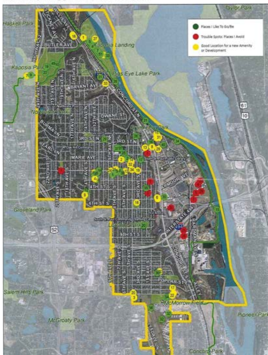
South St. Paul Comp Plan Engagement - Map Dot Exercise Responses